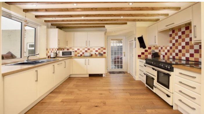
Our View "This very well presented property offers spacious living accommodation and very attractive low maintenance gardens"

A delightful three bedroom detached property with garage, off road parking, and gardens located in the popular Cadewell area of Torquay.